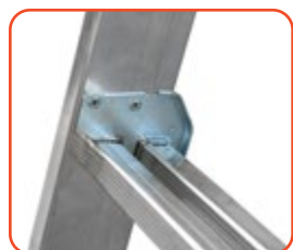
Gancio in alluminio, completo di dispositivo antiscivolo Aluminium hook as non-slipping device