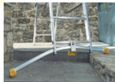
DISLIVELLO/ DIFFERENCE IN LEVEL MAX 15 CM