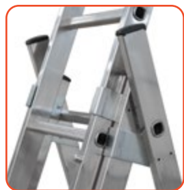
Articolazione in acciaio Steel hinge