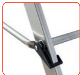
Tirante di sicurezza Security rod