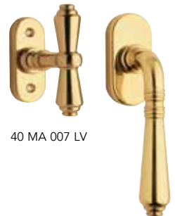
40 MA 007 LV