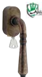
40 DK C67 AN

* Placca adatta a movimenti intercambiabili Plate suitable to interchangeable movements