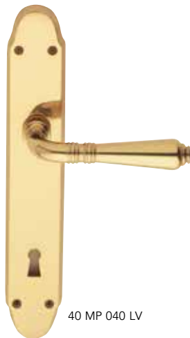
40 MP 040 LV