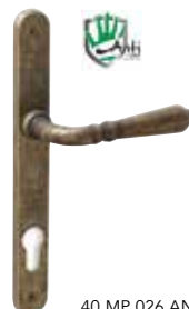
40 MP 026 AN

Per caratteristiche tecniche rosette vedi apposito capitolo soluzioni tecniche e componenti / For technical specifications rosettes see specific section technical solutions and components