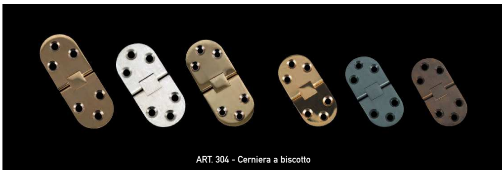
ART. 304 - Cerniera a biscotto