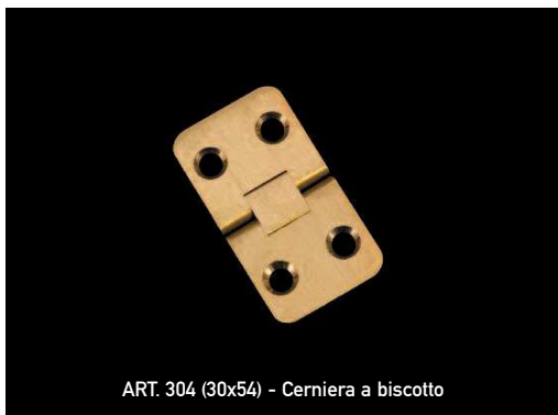
ART. 304 (30x54) - Cerniera a biscotto

Art. 304 (30x54) - Table Hinge - Plain swaged