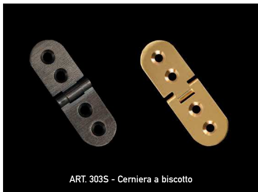
ART. 303S - Cerniera a biscotto