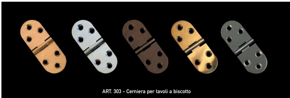
ART. 303 - Cerniera per tavoli a biscotto