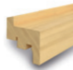
Cover cap for stay-hinge